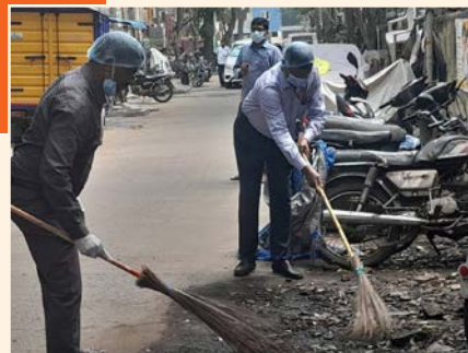
KK Nagar, Chennai, Tamil Nadu