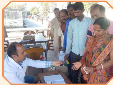
Jammu-Bari Brahmana, J&K