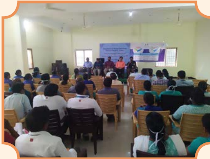
Salem, Tamil Nadu