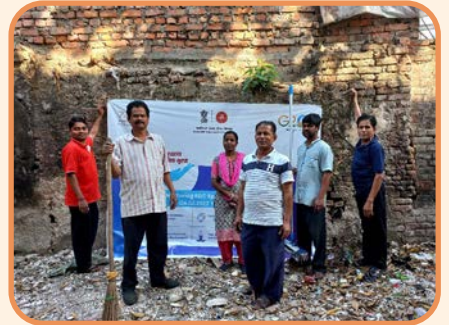
Kolkata, West Bengal