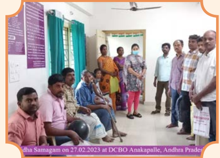
Annakapalle, Andhra Pradesh