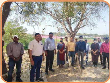
Varanasi, Uttar Pradesh