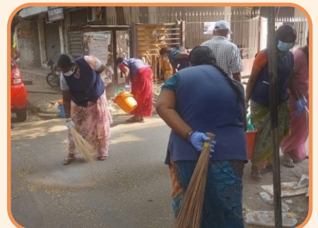
Chennai, Tamil Nadu