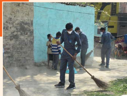
Varanasi, Uttar Pradesh