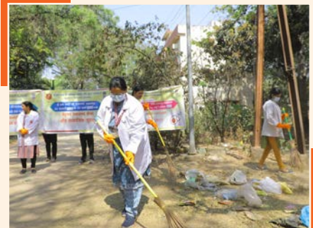
Sanathnagar, Hyderabad, Telangana