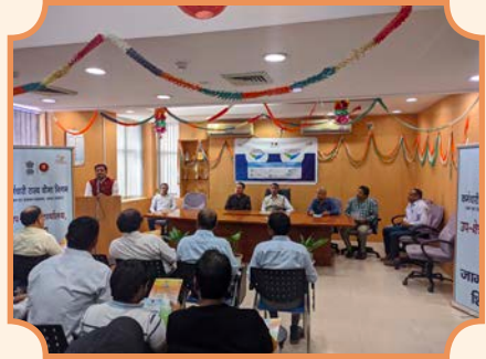
Noida, Uttar Pradesh