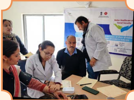
Badli, Himachal Pradesh