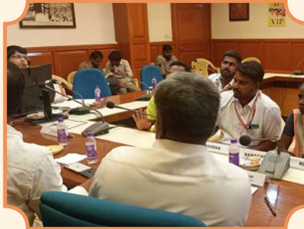
Hyderabad, Andhra Pradesh