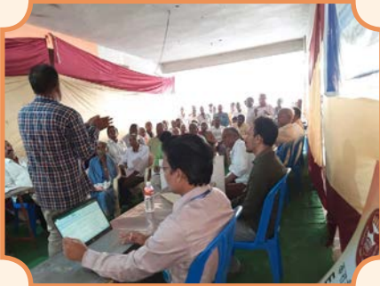
Visakhapatnam, Andhra Pradesh