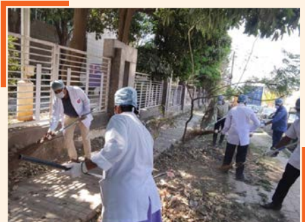
ESIC Hospital Peenya, Karnataka