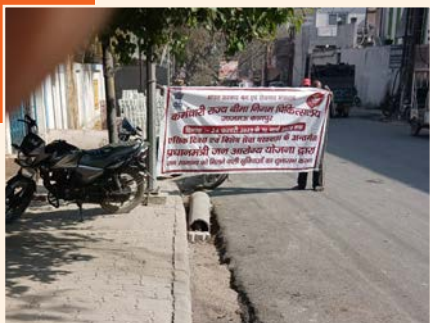
Jajmau Kanpur, Uttar Pradesh