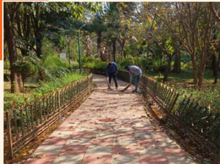
Rajajinagar Bangaluru, Karnataka