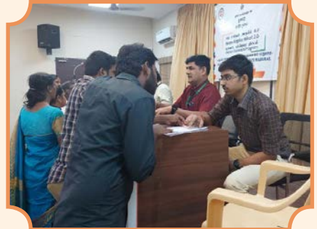
Madurai, Tamil Nadu