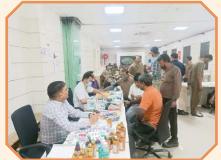
Lucknow, Uttar Pradesh