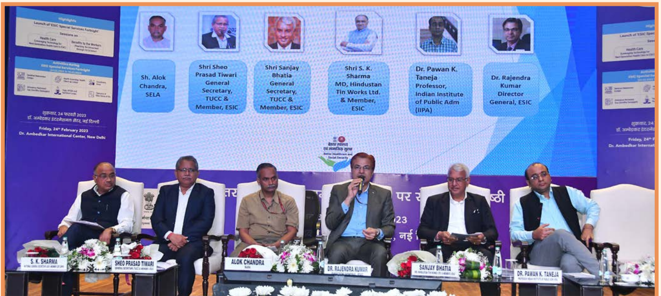
Session 3-Benefits to the workers: Reaching the Unreached' through ESIC Scheme