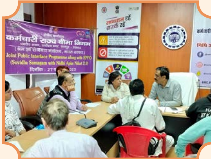
Kanpur, Uttar Pradesh