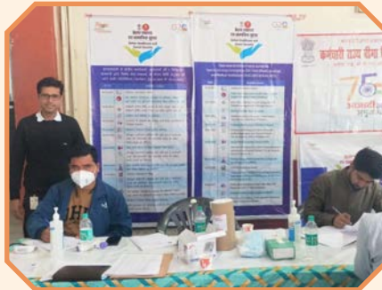
Bareilly, Uttar Pradesh