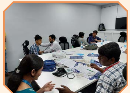
Kolkata, West Bengal