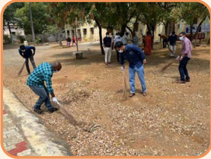
Tirunelveli, Tamil Nadu