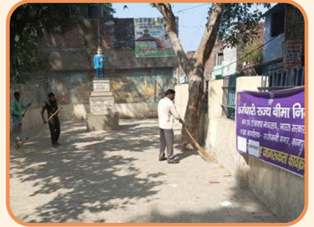
Kanpur, Uttar Pradesh