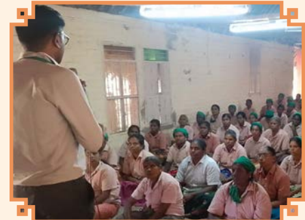
Madurai, Tamil Nadu