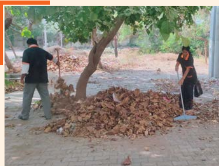
Dental College, Kalaburgi, Karnataka