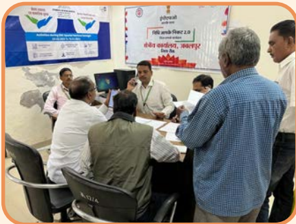
Bhopal, Madhya Pradesh