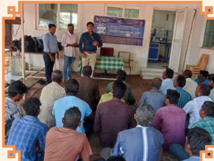
Madurai, Tamil Nadu