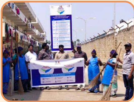
Vijayawada, Andhra Pradesh