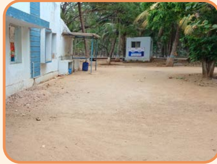
Coimbatore, Tamil Nadu