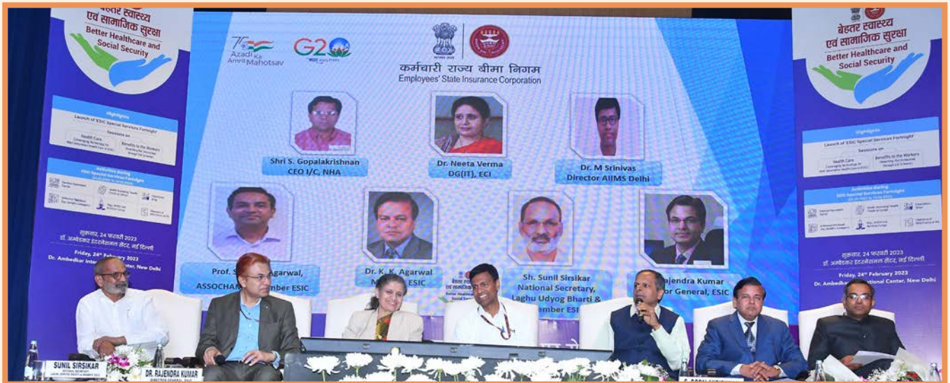
Session 2-Health Care: Leveraging Technology for Next Generation Health Care in ESIC

The discussions focused on the role of information and communication technologies in leveraging technology for better outcomes in the health sector and increasing the outreach by bringing the workers of the unorganized sector under the ambit of social security schemes.