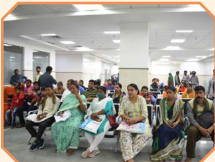
Varanasi, Uttar Pradesh