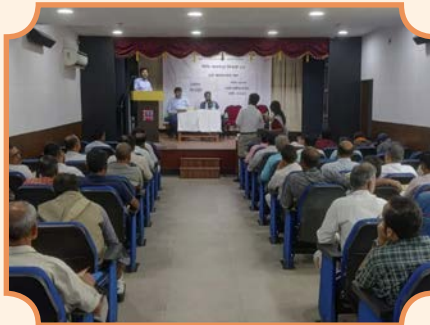
Kolkata, West Bengal