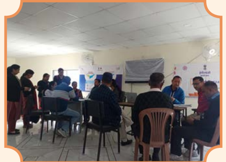
Mandi, Himachal Pradesh