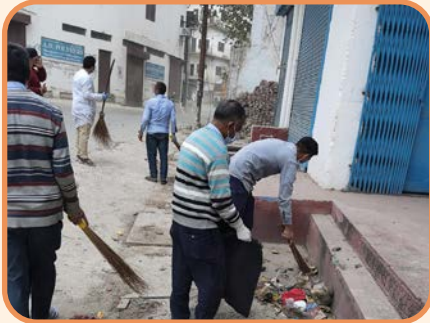
Baddi, Himachal Pradesh