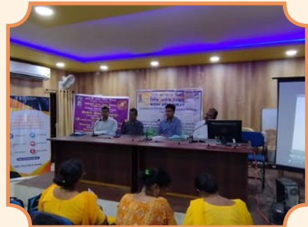
Barrackpore, West Bengal