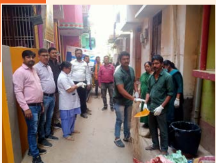
Phulwari Sharif, Bihar